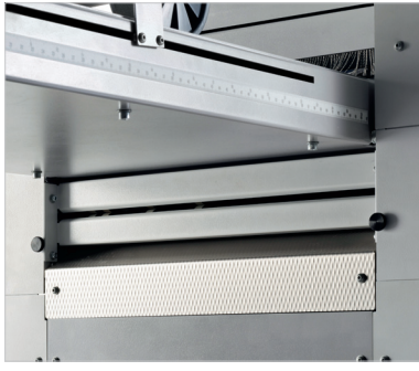
Perforating and slitting devices (optional)